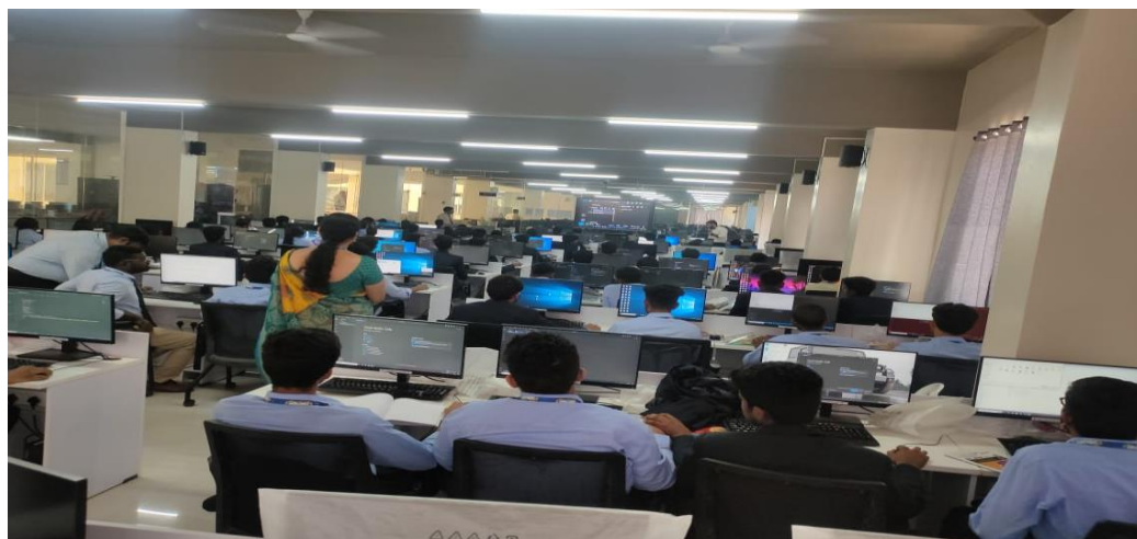
07/03/2024, 1:20PM-3:50PM ( IT- B& C: Room No.7112)