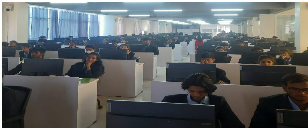
07/03/2024, 1:20PM-3:50PM (CSE(AI&ML)- A& B IT- C: Room No.7113)